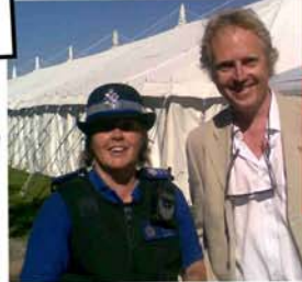
Supporting the Police