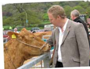
Supporting North Somerset Agricultural Show