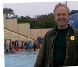
Supporting Portishead Open air Pool