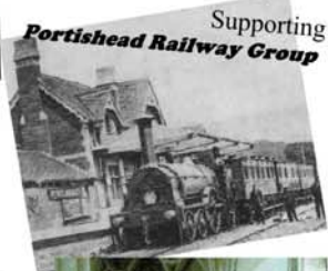
Supporting Portishead Railway Group