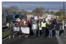
Supporting North Somerset People against the Pylons!