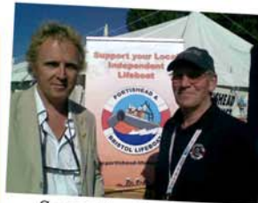
Supporting Portishead & Bristol Lifeboat

At the end of 2006 he became the Lib Dem Candidate for North Somerset, and has spent much time knocking on doors to hear first hand what householders want done in the constituency.