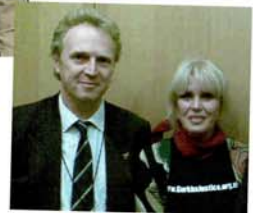
Supporting the Ghurkas with Joanna Lumley