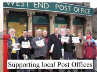
Supporting local Post Offices